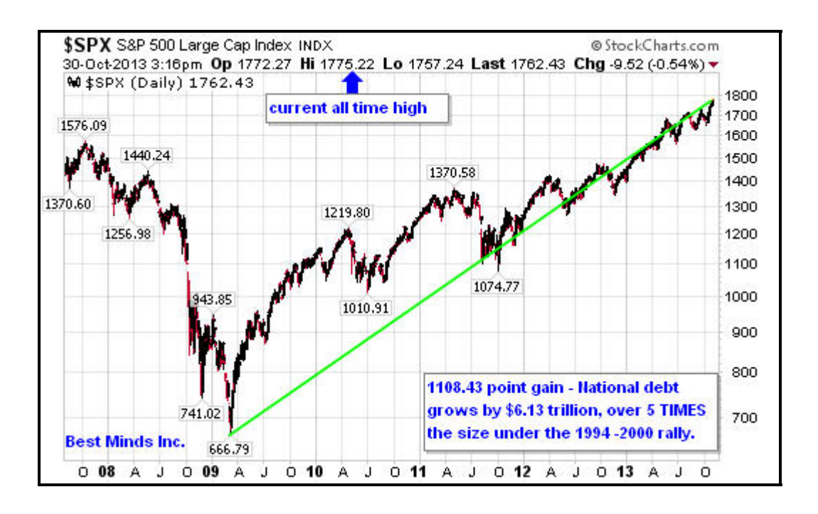
Question – Have extreme amounts of leverage been the iceberg underneath this entire rally?"

Answer – Yes. Once again, the evidence is there for those interested.