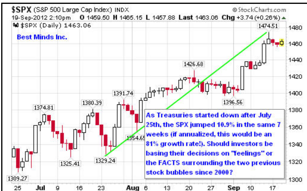
[Two Charts Above From Powder Kegs and Photo Ops , Public Article, 9/19/12]

I start with the period since the May 2, 2011 top, since it has been the most frustrating in my career in the attempt to find "the top" of credit bubble three. On May 2, 2011, I released the article, The Gallery of Crowd Behavior Returns . If you look up this article, you will find that it was my opinion that the US dollar was at a major bottom and the Euro was at a major top at that time. The charts were produced on May 2 nd , when the Euro hit an intraday high of 149.02, and the