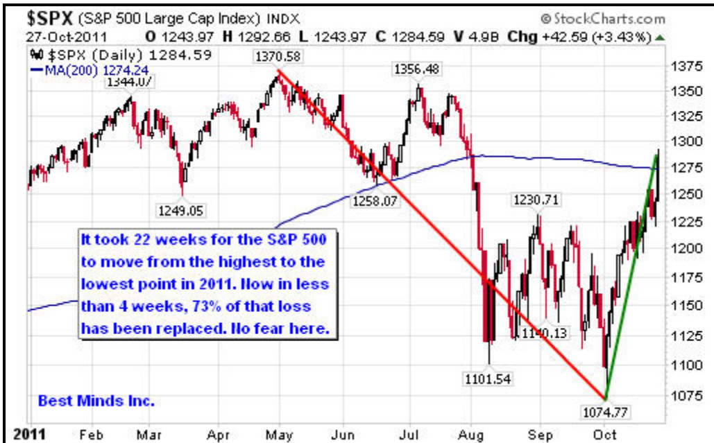
[From Darwin's Dangerous and Deceptive Devices, Public Article, 10/27/11]